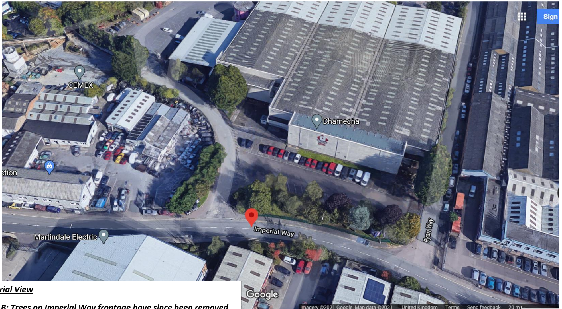
Aerial View (N.B: Trees on Imperial Way frontage have since been removed)