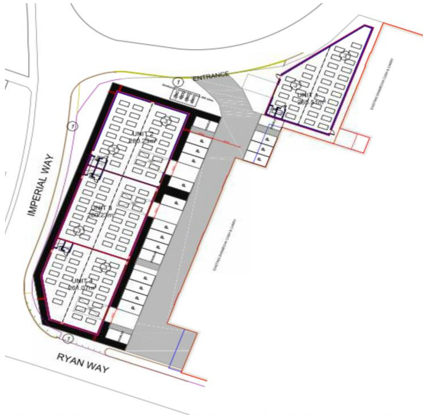
Proposed Site Layout Plan