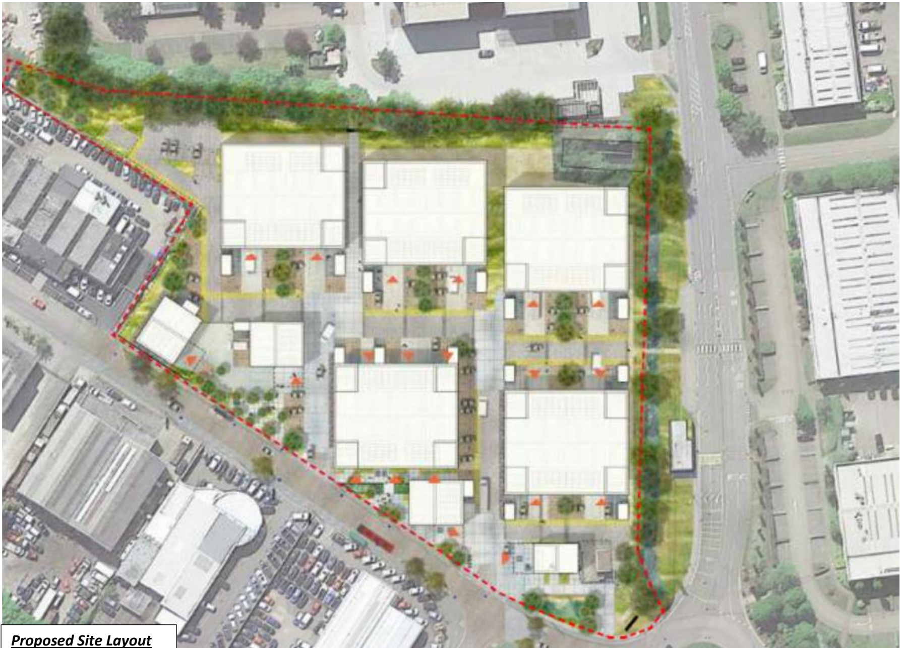
Proposed Site Layout