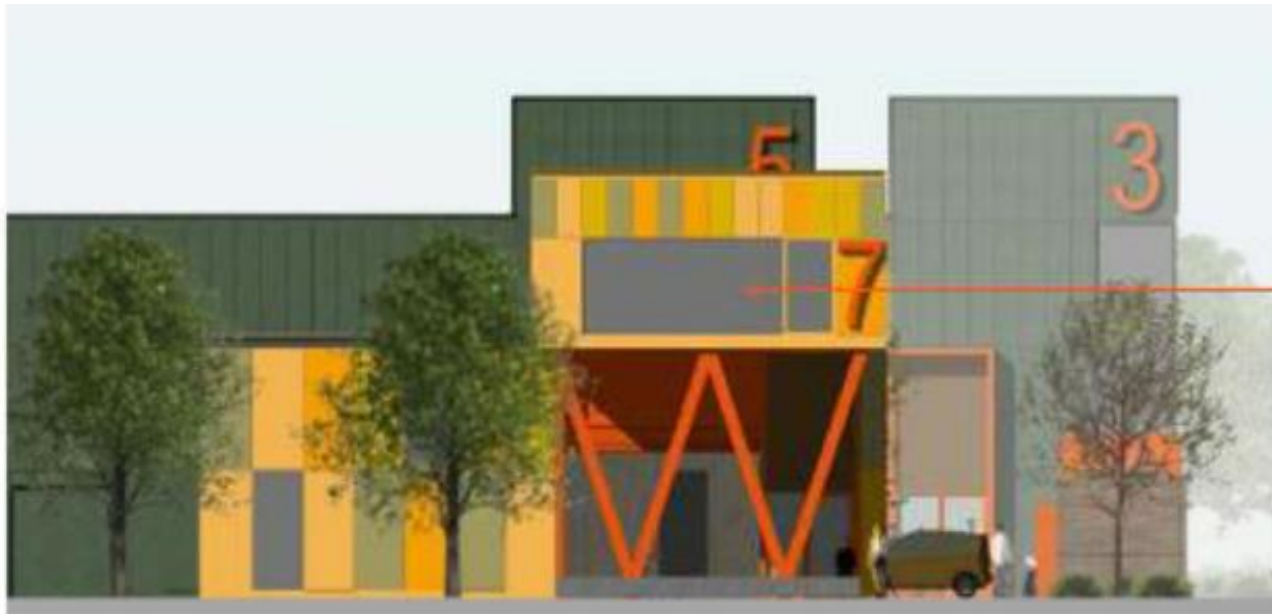
Illustrative front elevation of Pavilion 7