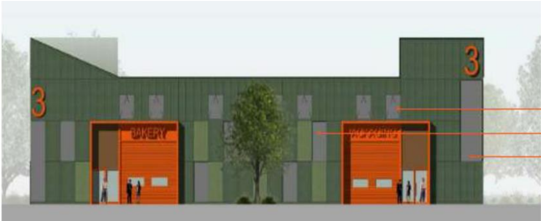
Proposed Elevations – Yard Buildings