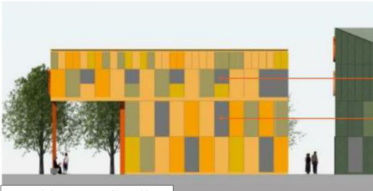
Proposed Elevations – Pavilion Buildings