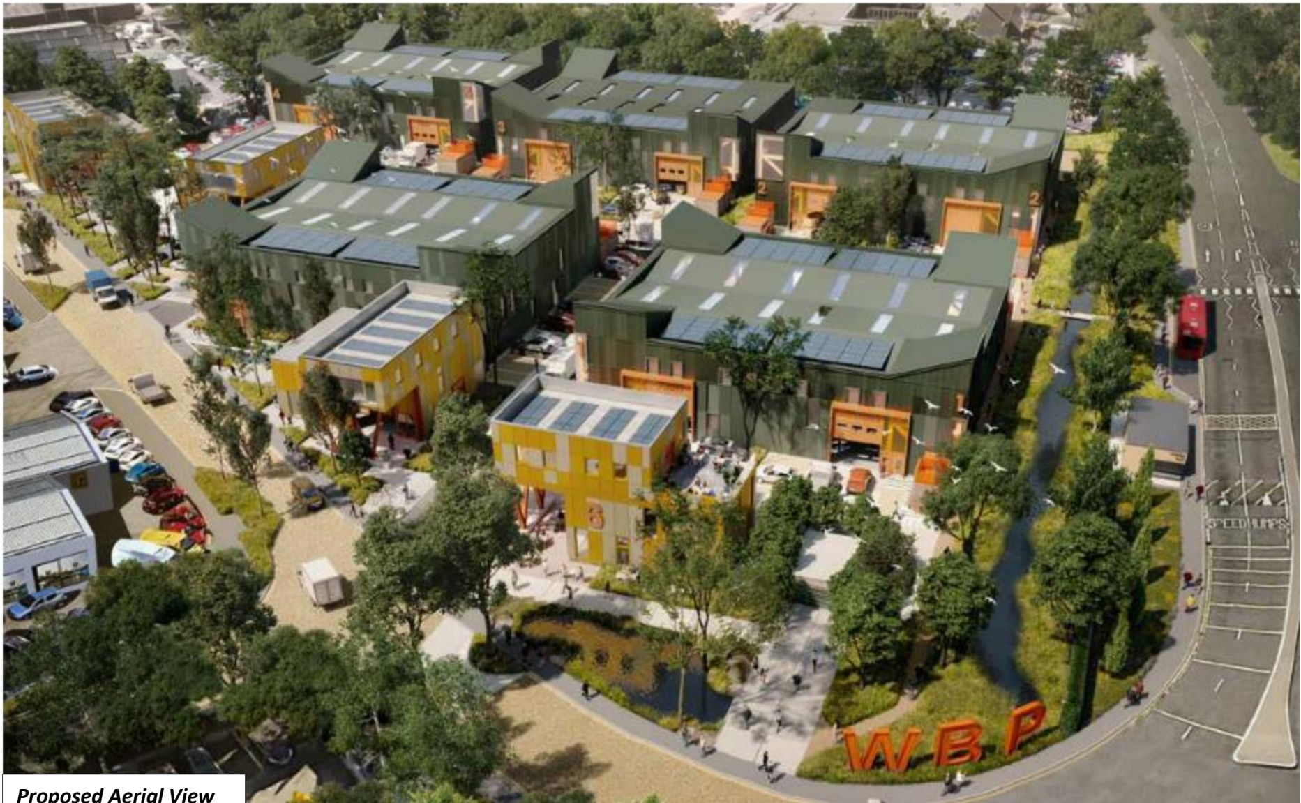
Proposed Aerial View