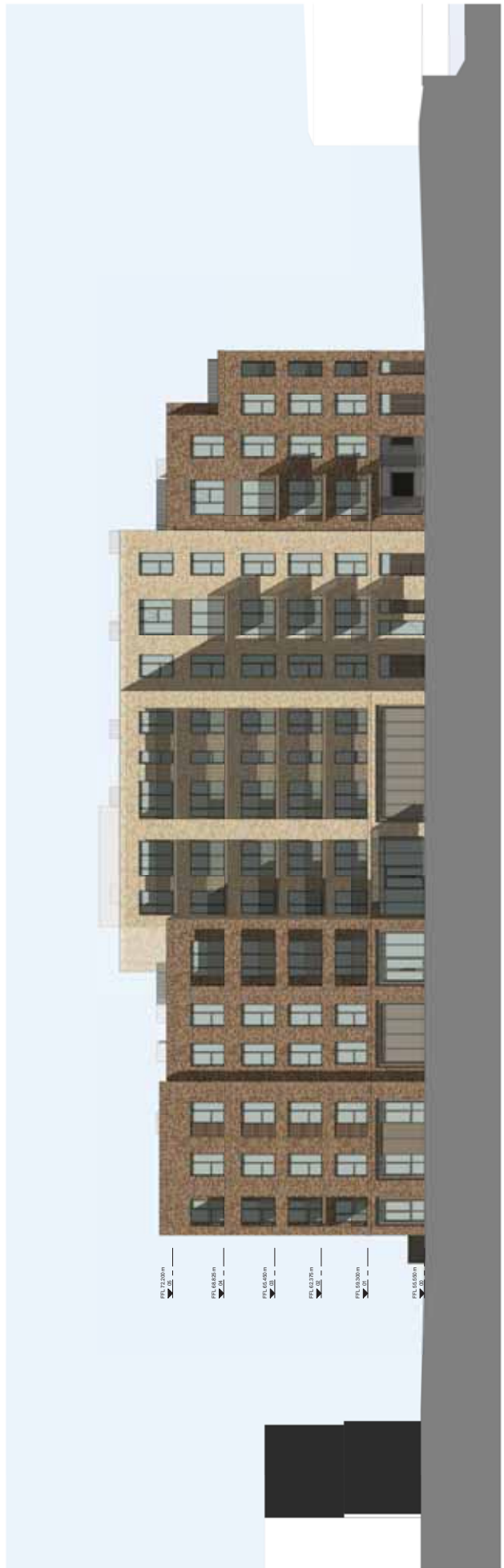
Block A - North Elevation 1:100

FFL 72.500 m FFL 69.500 m FFL 66.500 m FFL 63.500 m FFL 60.500 m FFL 57.500 m FFL 54.500 m