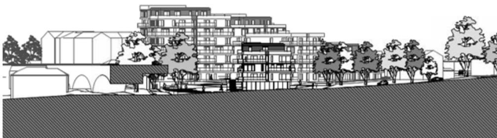
Elevation facing Chalk Hill