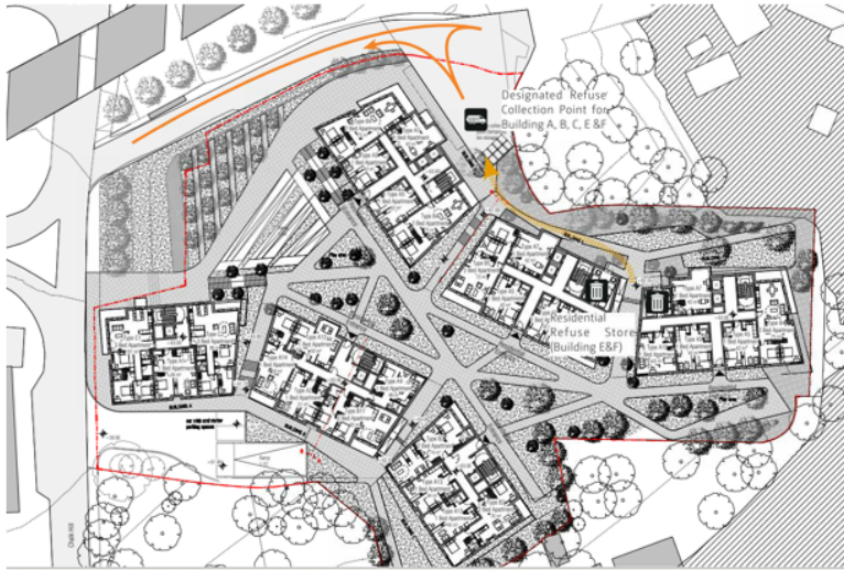
Upper Ground floor layout/floor plans