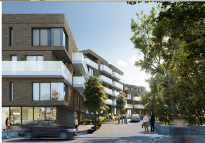
View from Chalk Hill