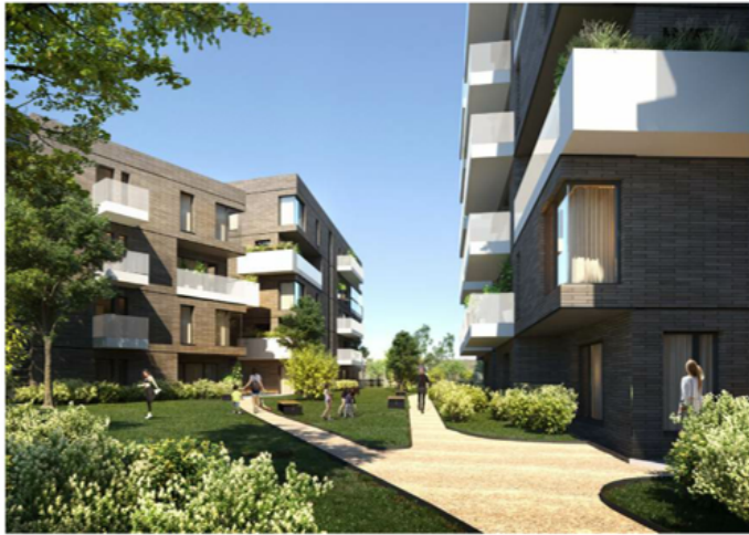
View from common amenity area