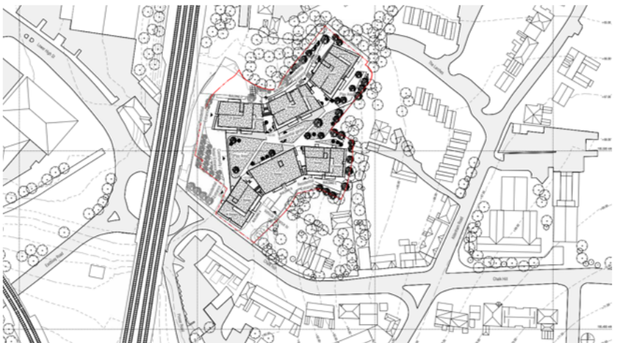
Proposed site layout