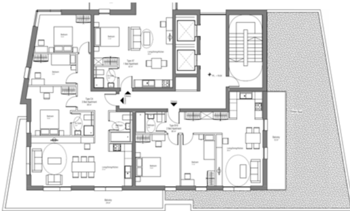
Apartment layout – 5 th , 6 th , 7 th floors blocks D, E and F