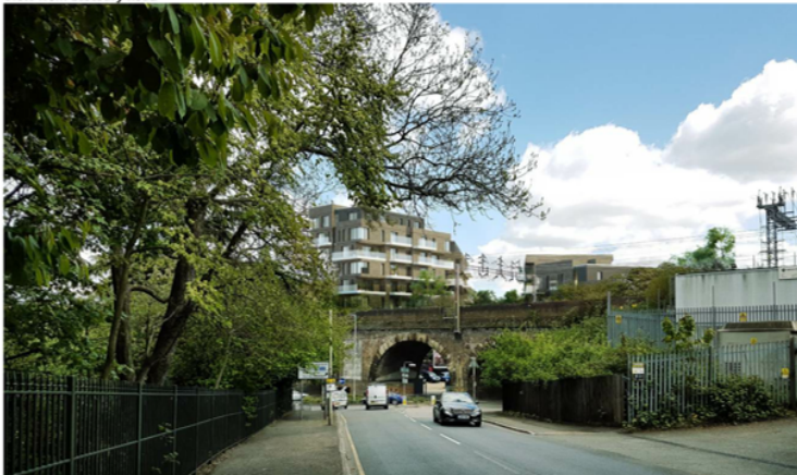
View from Eastbury Road