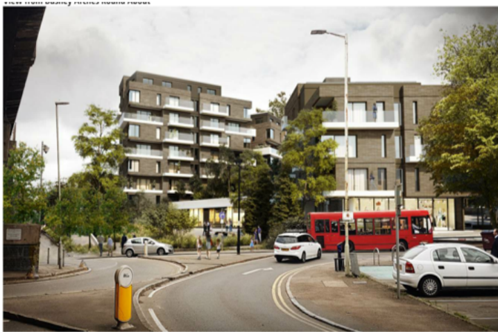
View from Bushey Arches Round About