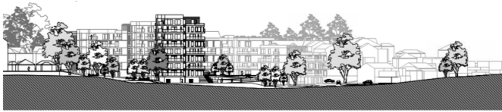
Elevation facing Railway Lines