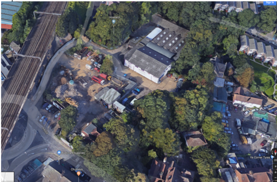
Aerial Photo of the existing site