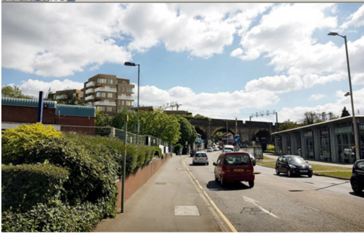
View from Lower High Street