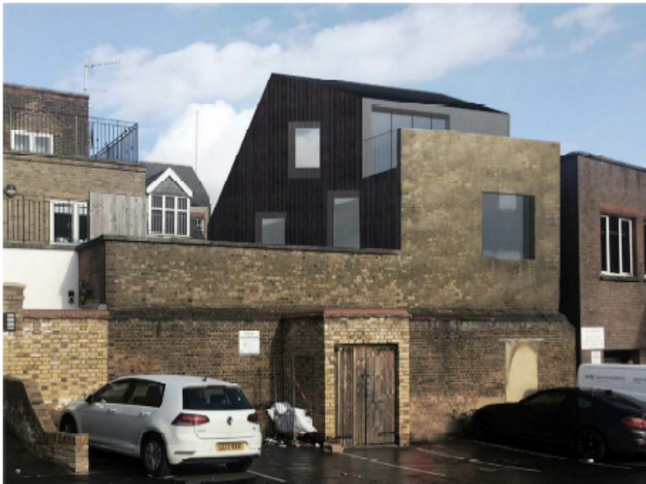
7 - CGI view from St Mary's View