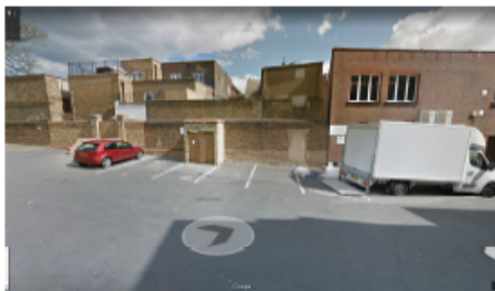
View from St Marys View to rear from Google Maps