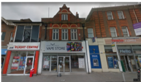
Street view from Google Maps